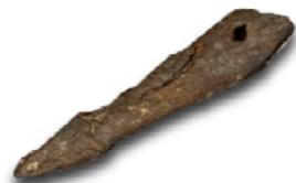
Iron pyramidal bolt head.