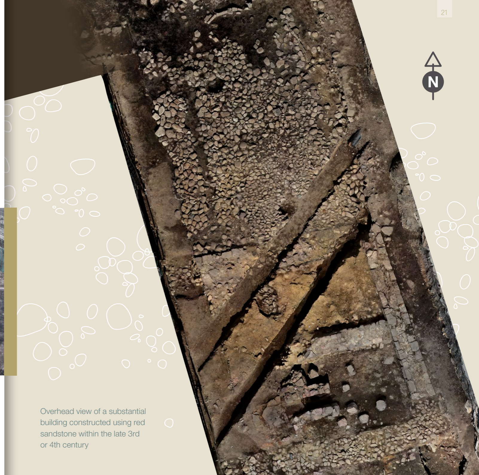
Overhead view of a substantial building constructed using red sandstone within the late 3rd or 4th century