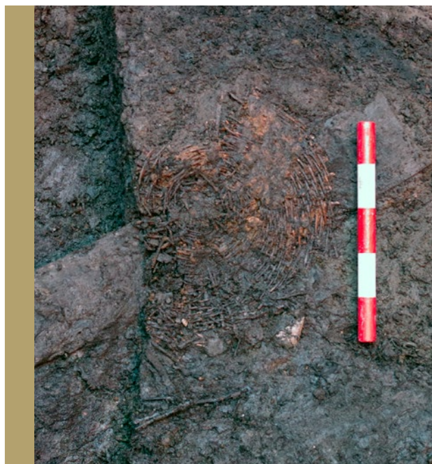
An extremely rare Roman wicker basket

The second century was a period of great growth and expansion for the settlement, coinciding with the abandonment of the first fort in the AD 120s.