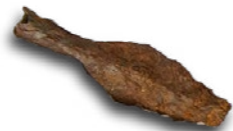
Iron socketed projectile.