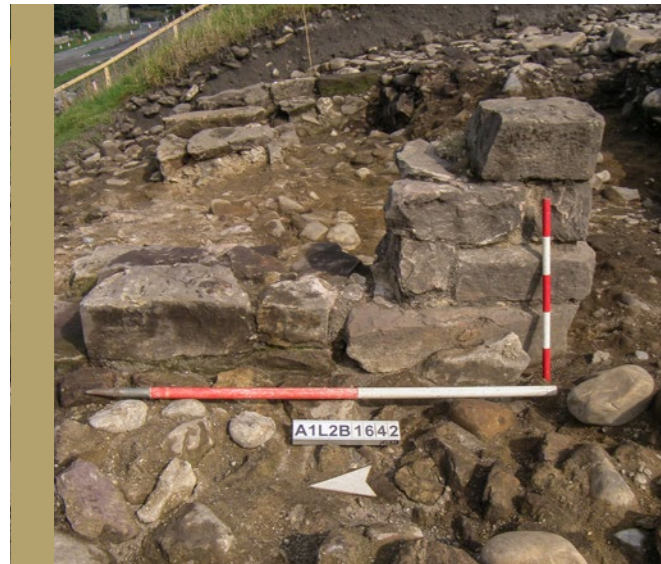
Gatehouse for the bridge crossing

By the late 3rd century at Fort Bridge a building constructed of red sandstone had been built. This high-status building contained evidence of painted wall plaster, a stone-flagged floor and a hypocaust (heating) system, providing under floor heating.