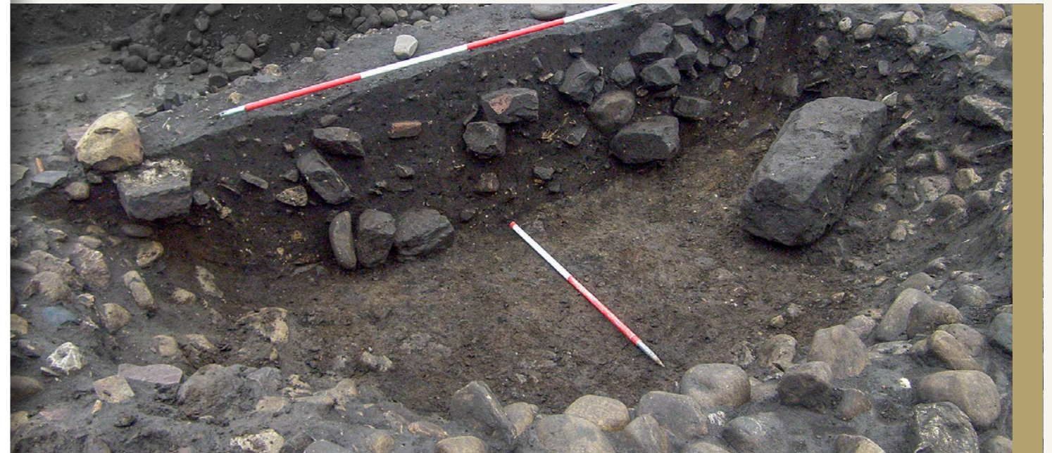
Anglo-Saxon sunken-featured building.

Although there is no direct evidence for continuation of settlement, due to a lack of dateable material between the early and late 5th century, it seems unlikely that the town would have been completely abandoned between the Romans leaving and the Angles from southern Denmark and northern Germany arriving. Dere Street would have remained a visible route, and the river crossing at Cataractonium would likely have been maintained. Cataractonium seems to have been abandoned by, or soon after, the mid-6th century, most likely in favour of the modern village of Catterick. The archaeological evidence from earlier investigations