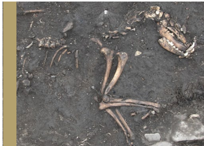
Anglo-Saxon dog burial.

There is also some evidence for smithing at Fort Bridge in the post-Roman period. The Early Anglo-Saxon material recovered from sunken-featured buildings is typical of settlement finds of this period. It includes equipment for household cloth production, such as bone pin-beaters and a ceramic spindle whorl, which suggests textile making took place inside the buildings. A dog burial was found at Agricola Bridge, and the dog may have worn a collar, as the corner of a bone weaving tablet with a drilled hole was found adjacent to its neck. This may have been reused as a tag, possibly representing identity and, or ownership of the animal.