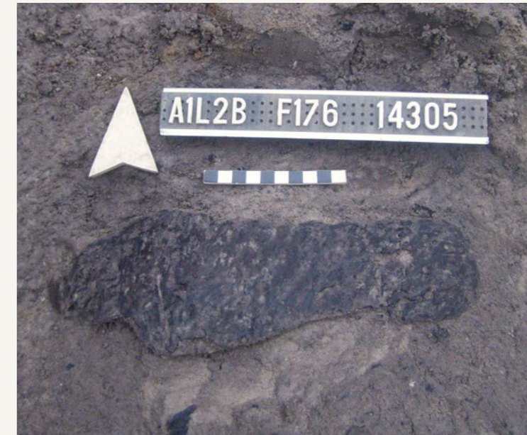
Leather shoe found at Fort Bridge.

Further evidence of leather working was found in a ditch and the well at Fort Bridge. This included a shoe, stitched sheet leather from tents and items of horse gear, implying a significant military presence. Leather had been found in a substantial midden dated to the early 2nd century at excavations during construction of the Catterick Bypass. This included a similar range of leather items to those recovered from Fort Bridge. The waste material found here was indicative of shoemaking. It is likely that the focus of any 'industry' related to leather working or shoe making was located to the west of Fort Bridge and closer to the fort.