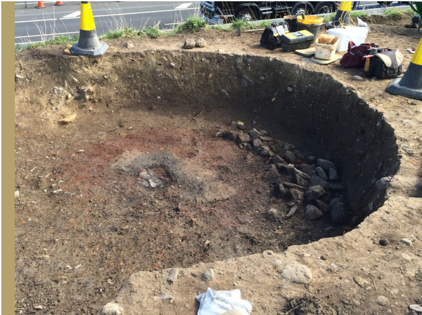
Possible drying oven.

Dere Street. No evidence for the function of the kiln was found, but was likely to have been a drying oven. Two ovens found at Brompton East likely had a similar function.