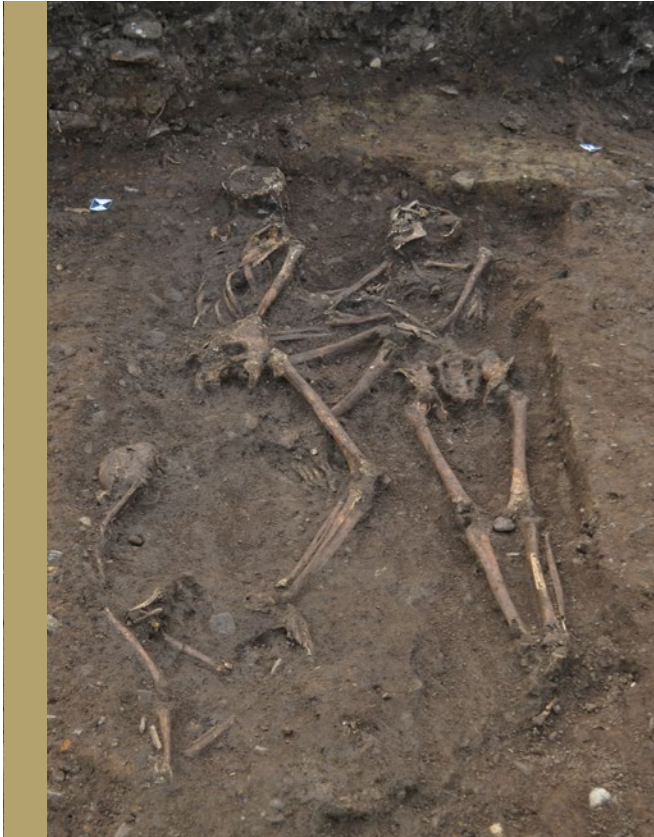
The family burial group.

In the 3rd century the northern suburb continued to be occupied, although the importance of this area seems to have decreased, with many of the building plots on the street front vacant. Burials were discovered in the back-plots, often in the boundary ditches. This suggests that this area was seen as being outside the main settlement in this period. One burial was of a possible family group and contained an adult male, an adult woman, and three children.