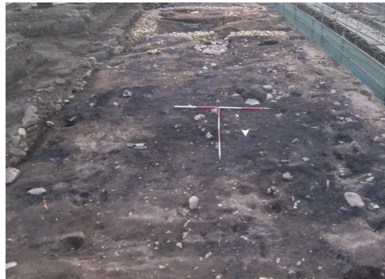
Area of burning during the early 3rd century

The substantial level of re-planning and the construction of high-status stone buildings and defences demonstrate that a substantial investment was dedicated to the development of the town. The town must have had significant resources and was becoming consciously more urban.