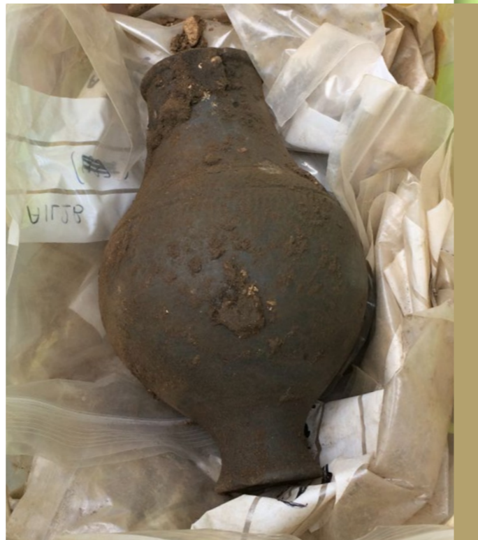
Near complete vessel.