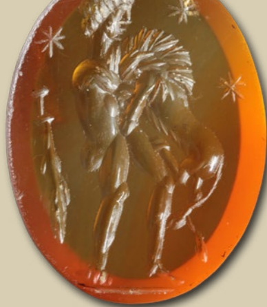
Intaglio found at Cataractonium.