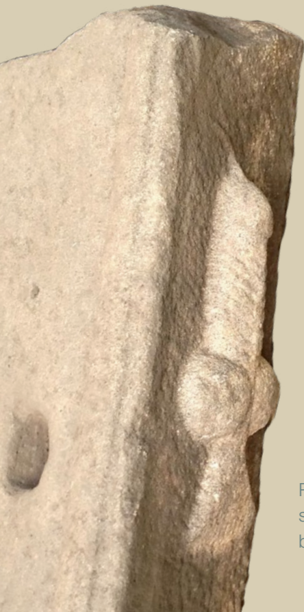
Rock carved with phallic symbol, likely part of the bridge structure.