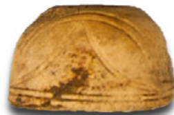
Sword pommel made of bone.