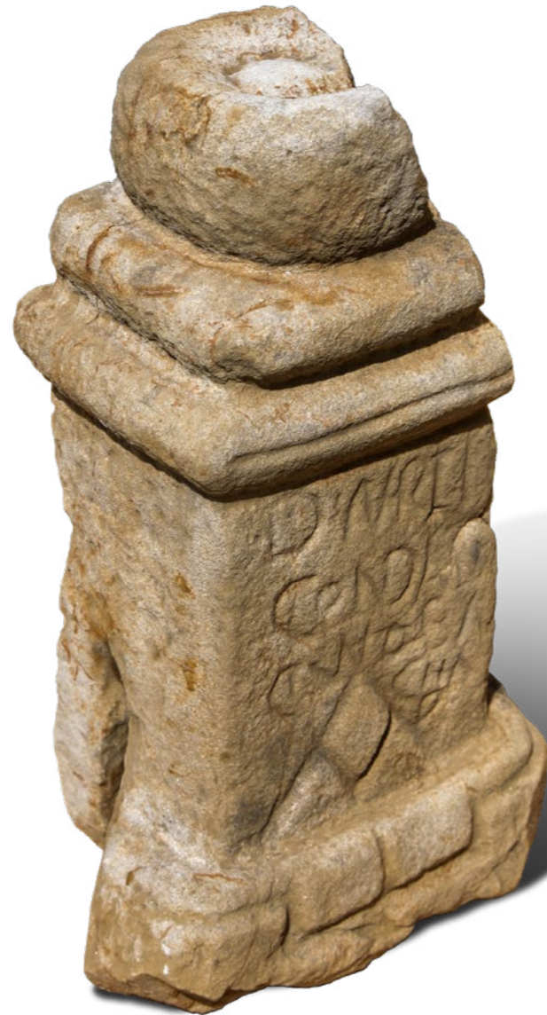
Altar found at Scurragh House.

Further north, a major new Roman settlement was located at Scotch Corner providing some of the earliest and highest quality evidence of Roman activity in the North of England. The site provides evidence for the formalisation of existing road networks, and Scotch Corner became a key junction between Dere Street and the Stainmore Pass, which aligns roughly with the A66.