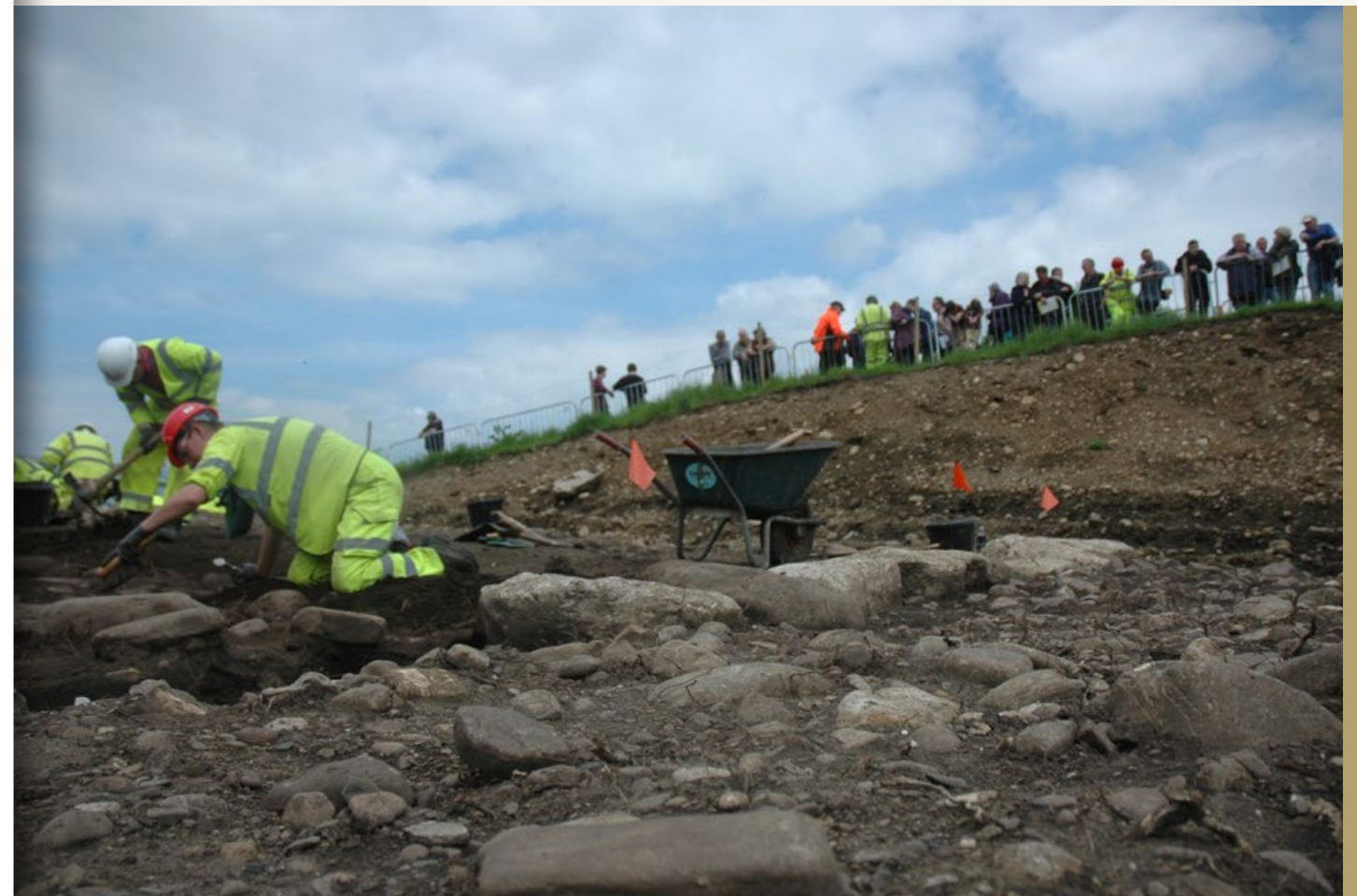
Open day at Catterick 31st May 2014 - visitors watch the excavation.